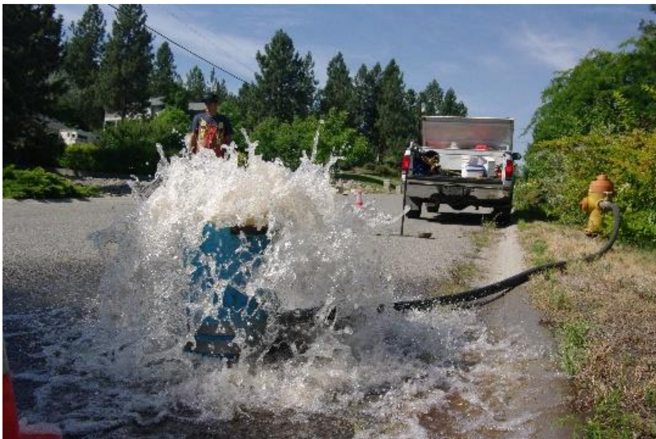
13 Flushing in Progress

Regular inspections, maintenance and water quality testing is performed by certified operators to ensure optimal operation of the GEID water systems. The district performed unidirectional flushing in the summer of 2023 and conducted isolated area flushing as required due to maintenance, repair activities, and to maintain water quality.